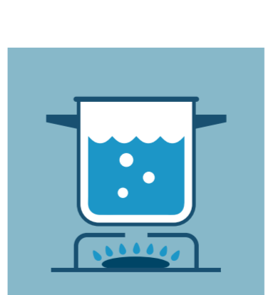
Thoroughly cook meat and eggs