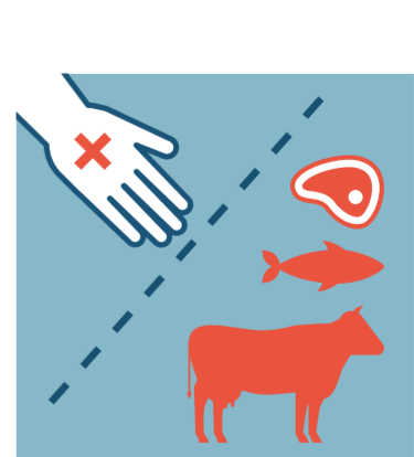
Avoid contact with animals