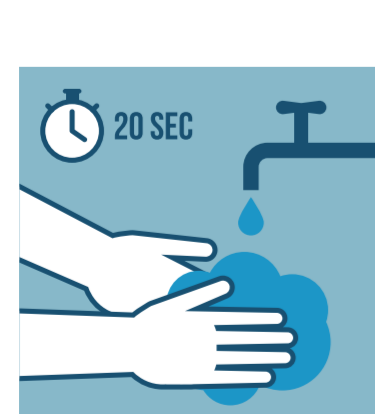
Wash hands at least 20 seconds